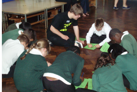
A group of year 6s during M.O.U.S.E.